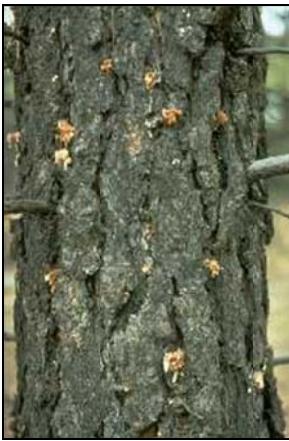
Pitch tubes caused by attacking mountain pine beetle and adult beetle pitched out by tree