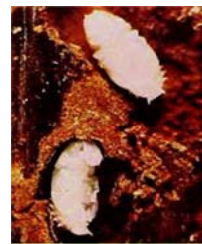
Mountain pine beetle egg and larval galleries (left), larvae (top center), pupae (top right), and adult (bottom right). Mature larvae and adults are about the size of a grain of rice.